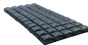
PRODIGY MATTRESS OVERLAY®