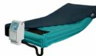
HYBRIDSELECT® LOW AIR LOSS MATTRESS OVERLAY SYSTEM