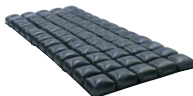
ROHO® PRODIGY MATTRESS OVERLAY®