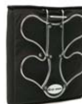
Retroback® Back Support System