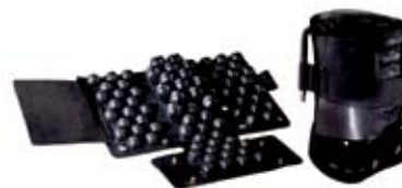
ROHO® HEAL PAD® Cushion