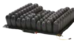
ROHO® CONTOUR SELECT® CUSHION